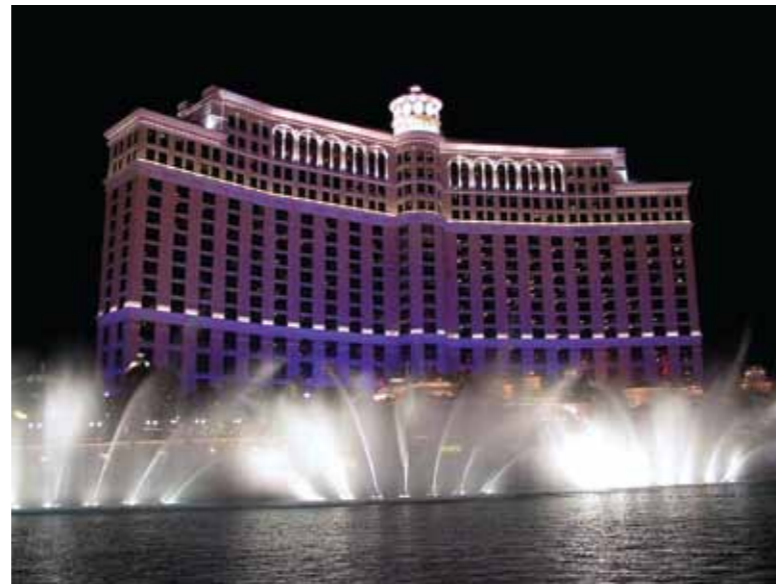
See the musical Bellagio Fountain

Overnight at Hotel Stratosphere / Circus Circus or similar, in Las Vegas.