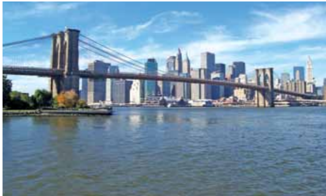
Skyline of New York