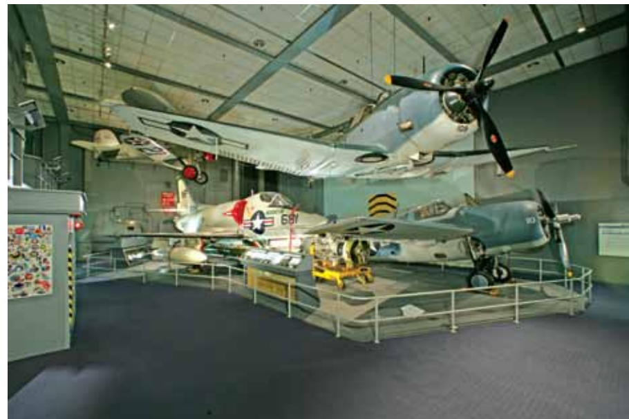
See the displays at the Smithsonian Air and Space Museum

Overnight at Hotel Comfort Inn / Wingate Inn or similar, in Washington.