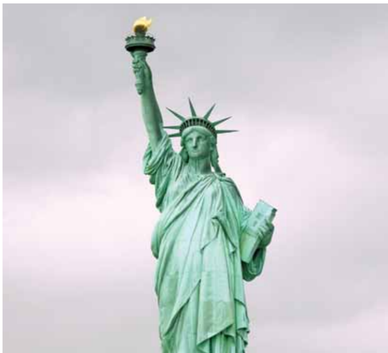
See the famous Statue of Liberty