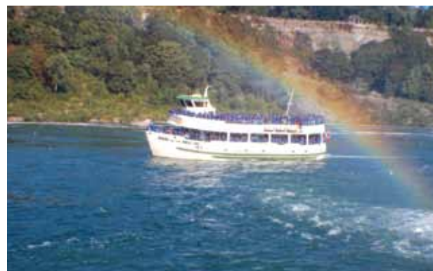
Enjoy the Maid of the Mist boat ride

Overnight at Hotel Quality Inn / Days Inn or similar, in Niagara Falls.