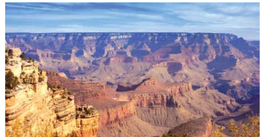
A chance to visit the Grand Canyon