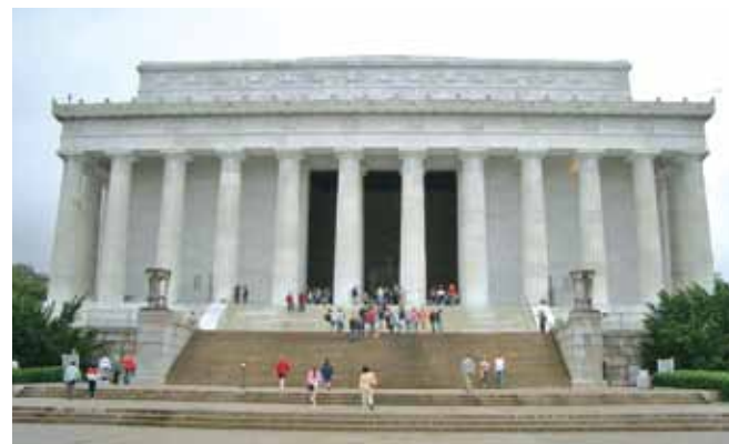
The Lincoln Memorial