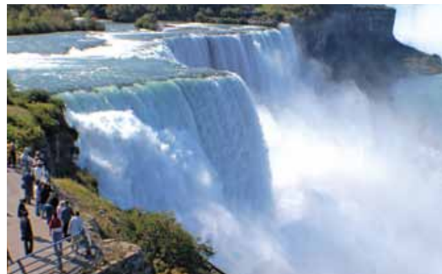
See the magnificent Niagara Falls