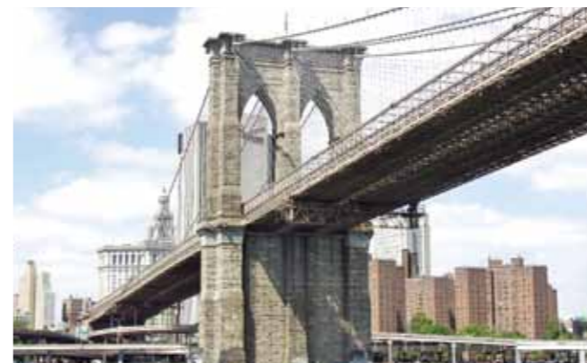
See the famous Brooklyn Bridge